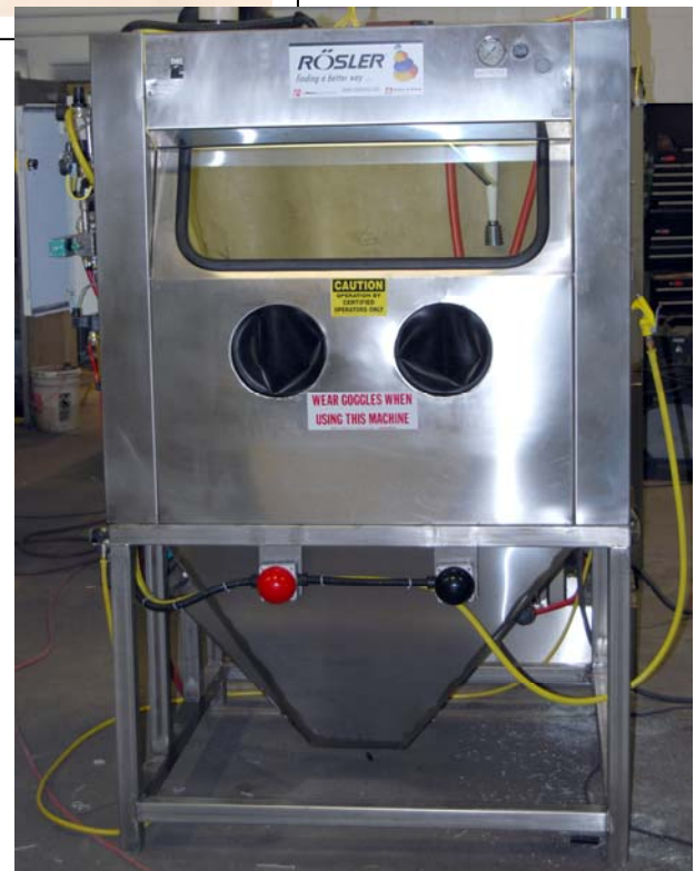
Wetblast Model JKS 48/1