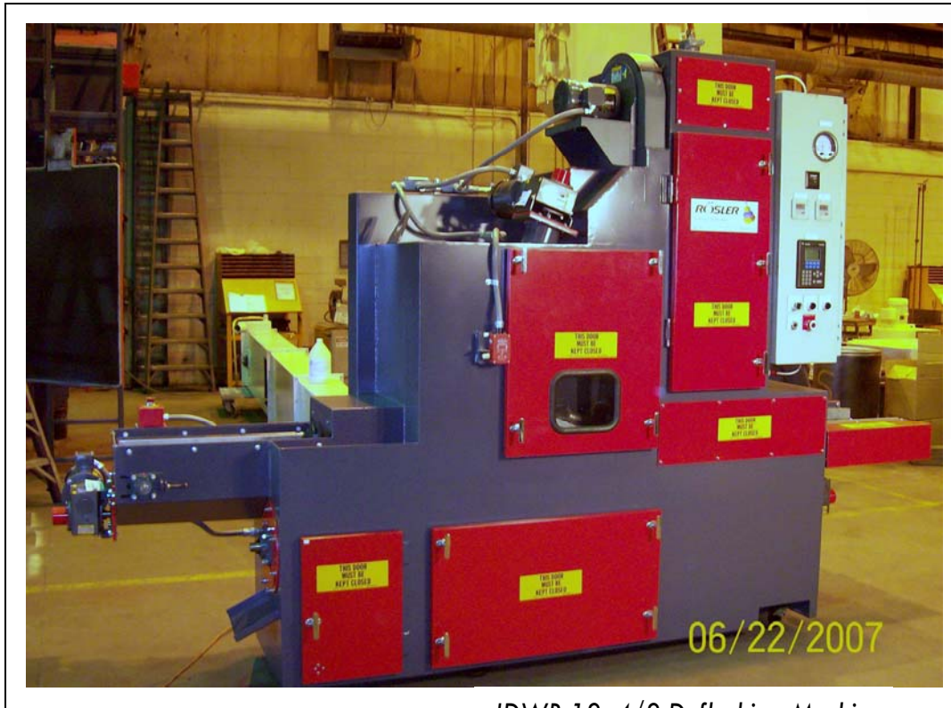
JDWB 12x4/2 Deflashing Machine