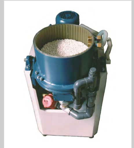
FKS E Series